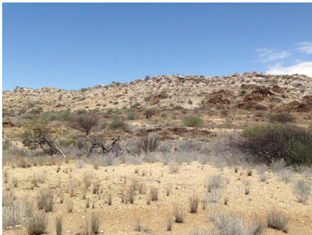
Figure 2: Outcropping formation at Area 51 Graphite Project