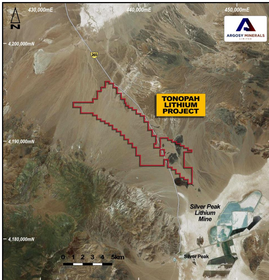
Argosy Minerals Limited – Tonopah Lithium Project Location Map (relative to Silver Peak Lithium Mine)

The Project has the following key characteristics: