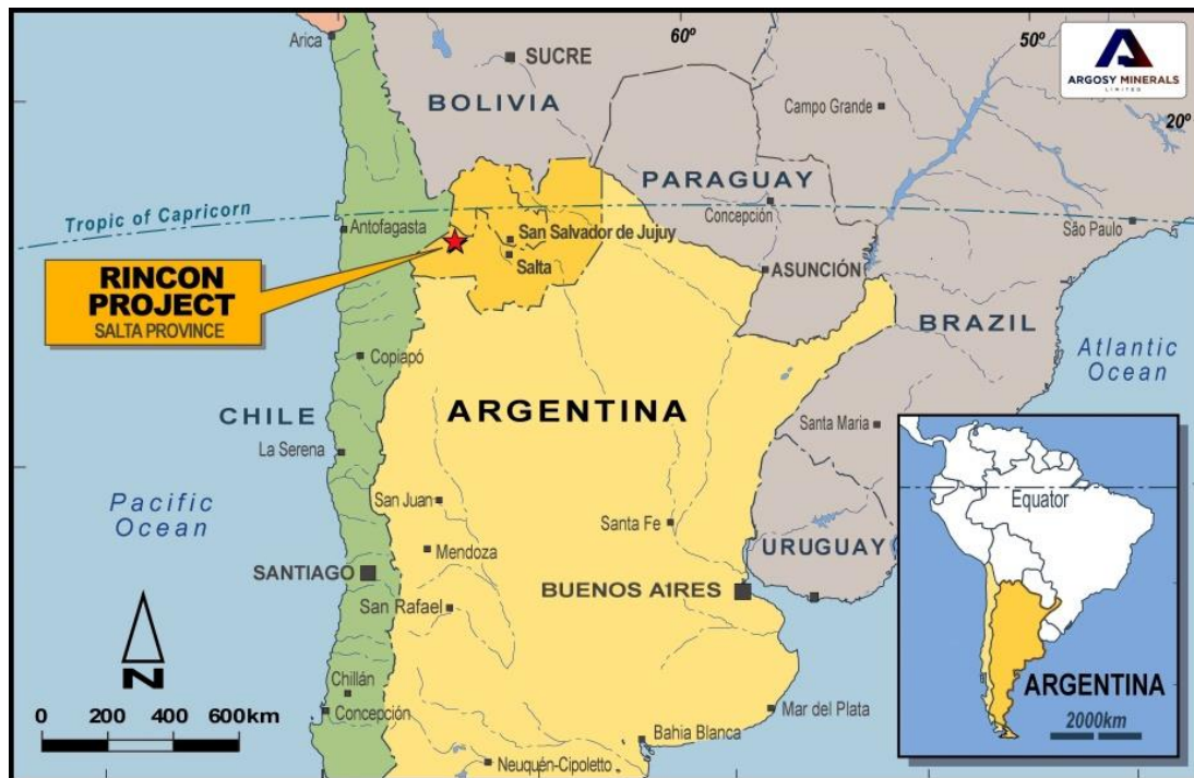
Argosy Minerals Limited – Rincon Lithium Project Location Map

Subsequent to the reporting period, Argosy executed a Sale Agreement with LCME Holdings Inc. (a subsidiary of Lithium Consolidated Ltd – ASX:Li3), Big Smokey Exploration LLC, ProspectOre LLC and ProspectOre Inc. for the acquisition of 100% of the tenements comprising the Tonopah Lithium Project, located in Nevada, USA.