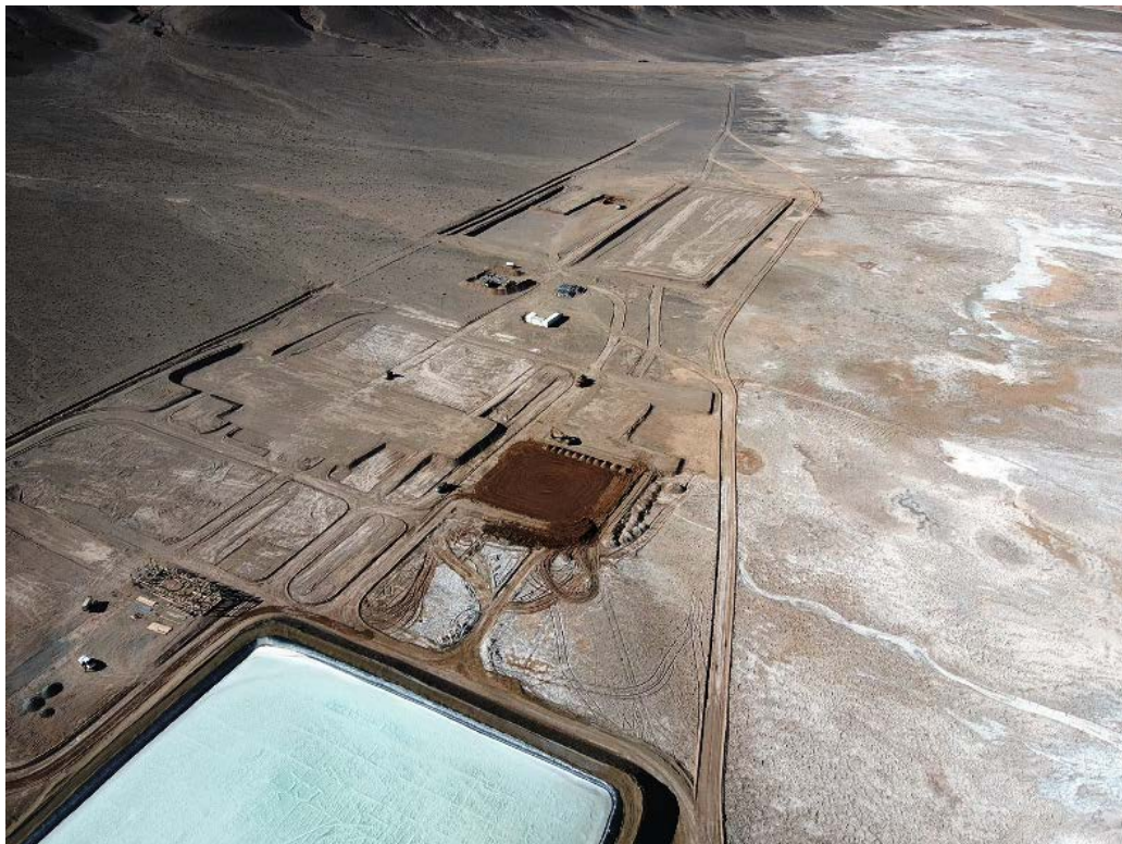
Figure 2. Rincon Lithium Project – 2,000tpa Operation Site Works in Progress