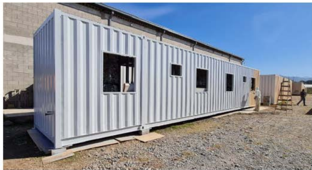
Figure 5. Rincon Lithium Project – 2,000tpa Operation Works in Progress (camp construction works)