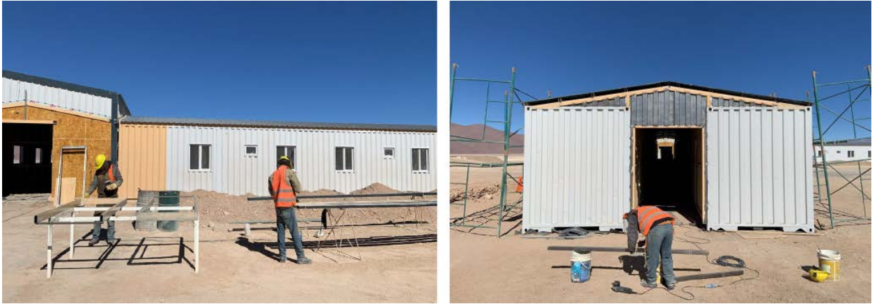
Figure 3. Rincon Lithium Project – 2,000tpa Operation Site Works in Progress (camp construction works)

The brine system works, comprising brine production wells, pumping stations and associated piping, and plant settling ponds, are also progressing toward completion.