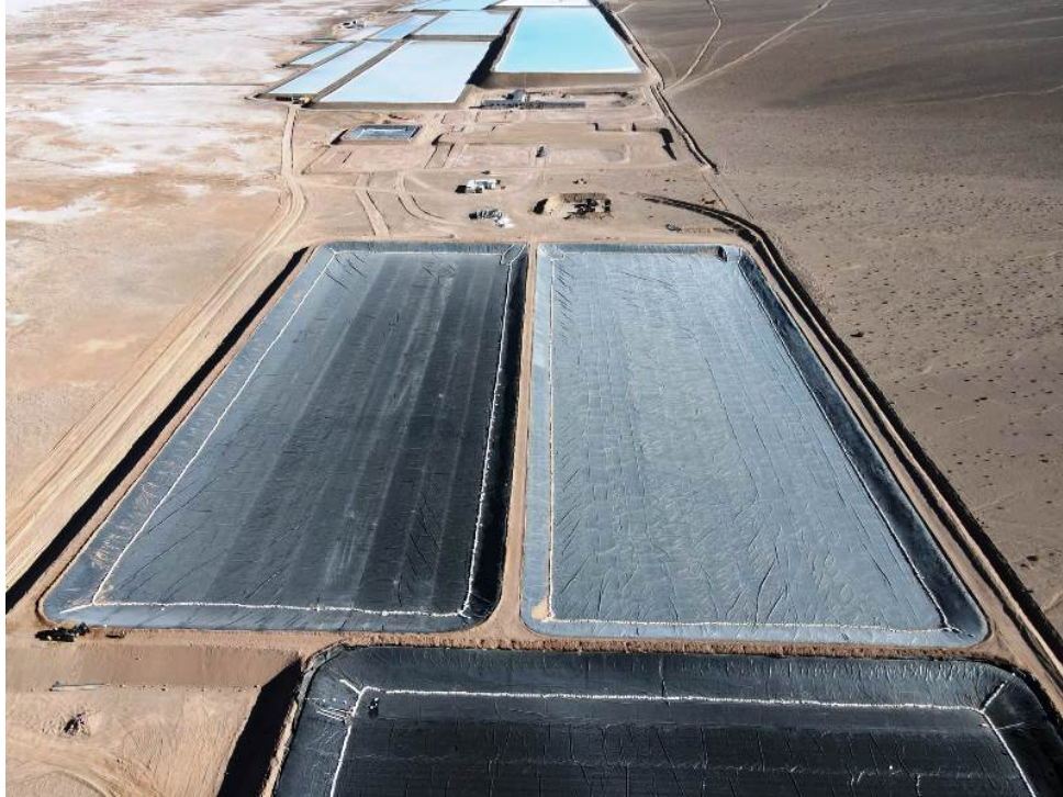
Figure 1. Rincon Lithium Project – 2,000tpa Operation Site Works in Progress

project development expansion. We look forward to a significant near-term growth phase from the increasing development activity at our Rincon Lithium Project."