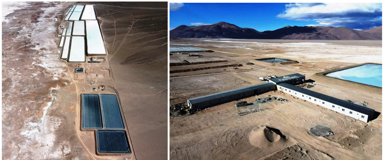
Figure 2. Rincon Lithium Project – 2,000tpa Operation Site Works

Coming works will focus on industrial plant construction works and plant equipment sourcing. Site works are considerably increasing, with major progress and significant advancement to be made over coming months.