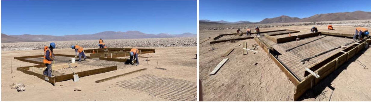
Figure 3. Rincon Lithium Project – 2,000tpa Operation Site Works (industrial plant constructions works)