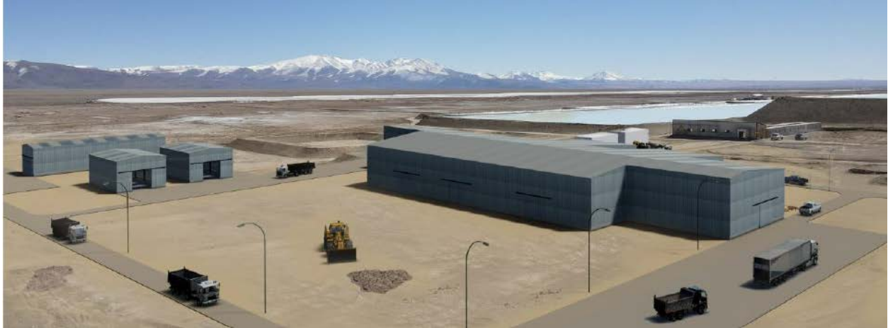
Figure 1. Rincon Lithium Project – 2,000tpa Operation Site Layout (schematic)

project development expansion. We look forward to a significant near-term growth phase from the increasing development activity at our Rincon Lithium Project.”