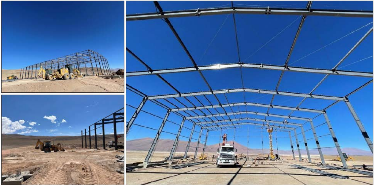
Figure 3. Rincon Lithium Project – 2,000tpa Operation Site Works (industrial plant constructions works)