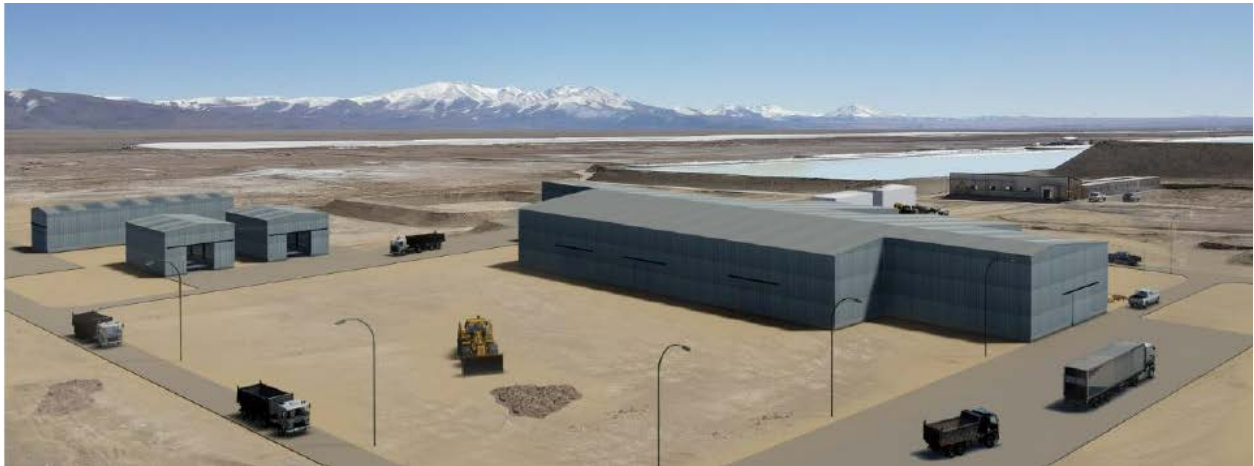
Figure 1. Rincon Lithium Project – 2,000tpa Operation Site Layout (schematic)

expansion. We look forward to a significant near-term growth phase and achieving our upcoming target of initial stage 2,000tpa production operations this year at our Rincon Lithium Project."