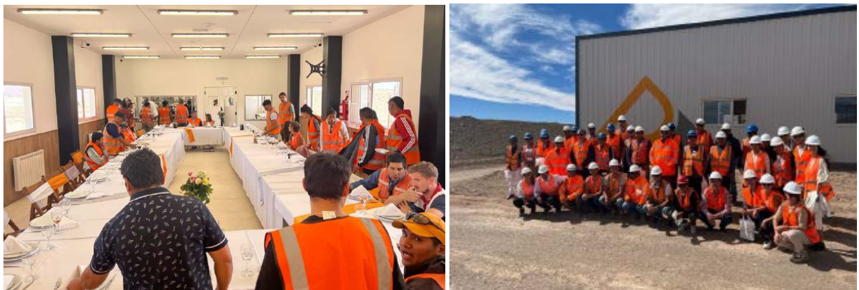
Figure 5. Rincon Lithium Project – 2,000tpa Operation Site Works