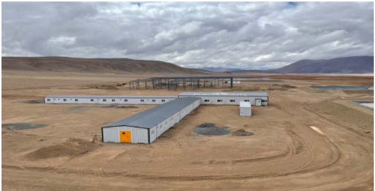
Figure 2. Rincon Lithium Project – 2,000tpa Operation Site Works

Upon completion of the construction phase works, the plant commissioning works, and production test-works and ramp-up to 2,000tpa operations will follow immediately thereafter.