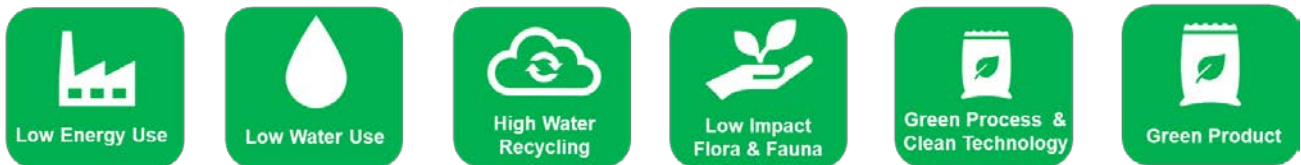
Figure 6. Rincon Lithium Project – Proprietary process technology with minimal environmental footprint

Enhancing Rincon’s clean and green credentials is the potential connection of the 208MW Altiplano 200 solar energy plant to power the 10,000tpa expansion operation. The renewable solar energy facility is immediately adjacent to Rincon and is a major distinctive benefit to assist the Company in producing clean lithium.