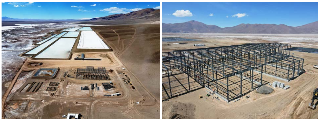
Figures 4-5. Rincon Lithium Project – 2,000tpa Operation Site Works in Progress

Offshore plant and equipment items, such as the evaporator/dryer and associated parts manufactured in Germany, are currently in the process of delivery – with the recent shipment departure from Europe and estimated delivery into Argentina during February. The press and belt filters procured and fabricated in Asia, have an estimated shipping departure from late-January and estimated delivery into Argentina during March-April. The processing mill was built in the USA and previously delivered.