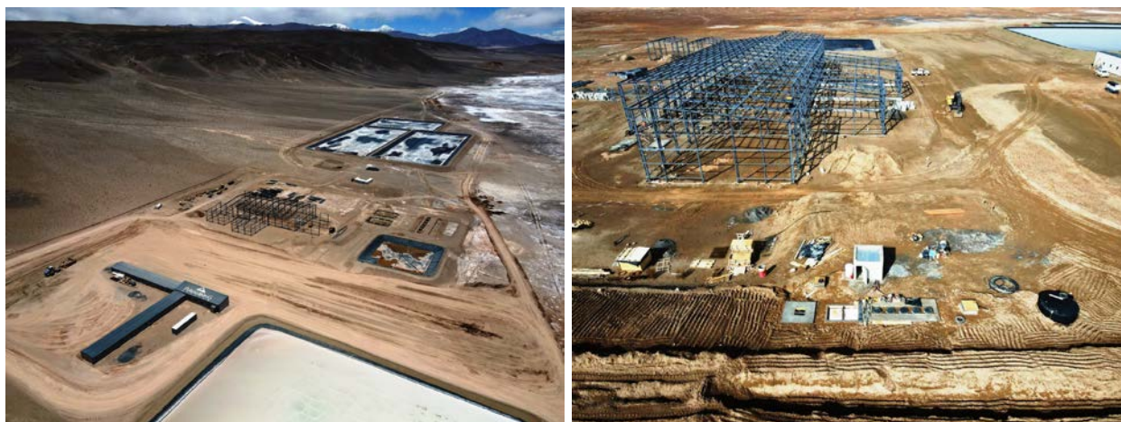
Figures 2-3. Rincon Lithium Project – 2,000tpa Operation Site Works in Progress

The Company is progressing toward successfully developing the modular 2,000tpa operation and become a commercial battery quality lithium carbonate producer.