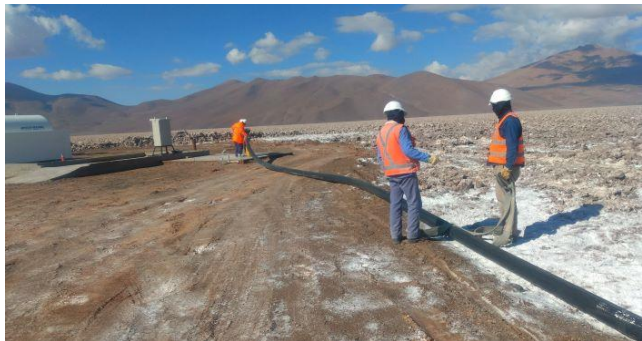
Figures 5-6. Rincon Lithium Project – 2,000tpa Operation Brine Systems Site Works