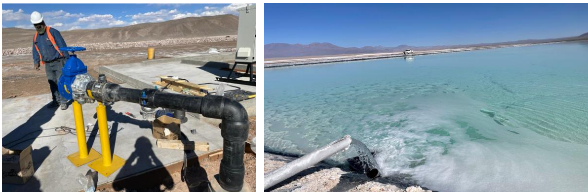
Figures 1-2. Rincon Lithium Project – 2,000tpa Operation Brine Systems Site Works

We are committed to achieving our upcoming targets and becoming only the 2 nd ASX-listed battery quality lithium carbonate producer and progressing toward the next stage 12,000tpa scale operations and beyond.