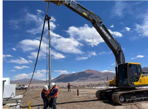
Figures 3-4. Rincon Lithium Project – 2,000tpa Operation Brine Systems Site Works