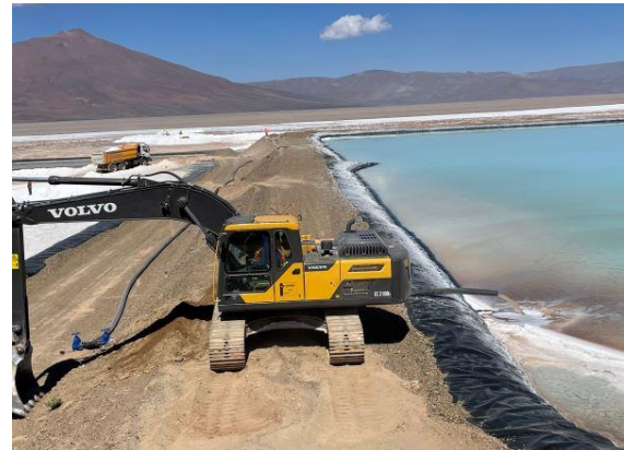
Figures 7-8. Rincon Lithium Project – 2,000tpa Operation Brine Systems Site Works