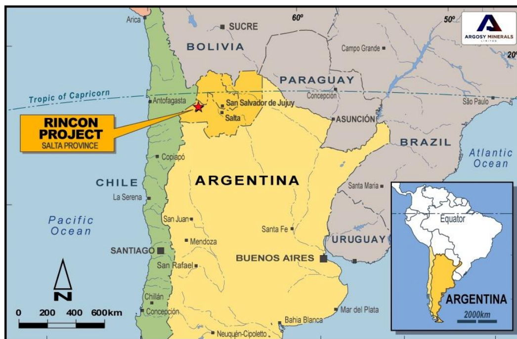
Argosy Minerals Limited – Rincon Lithium Project Location Map