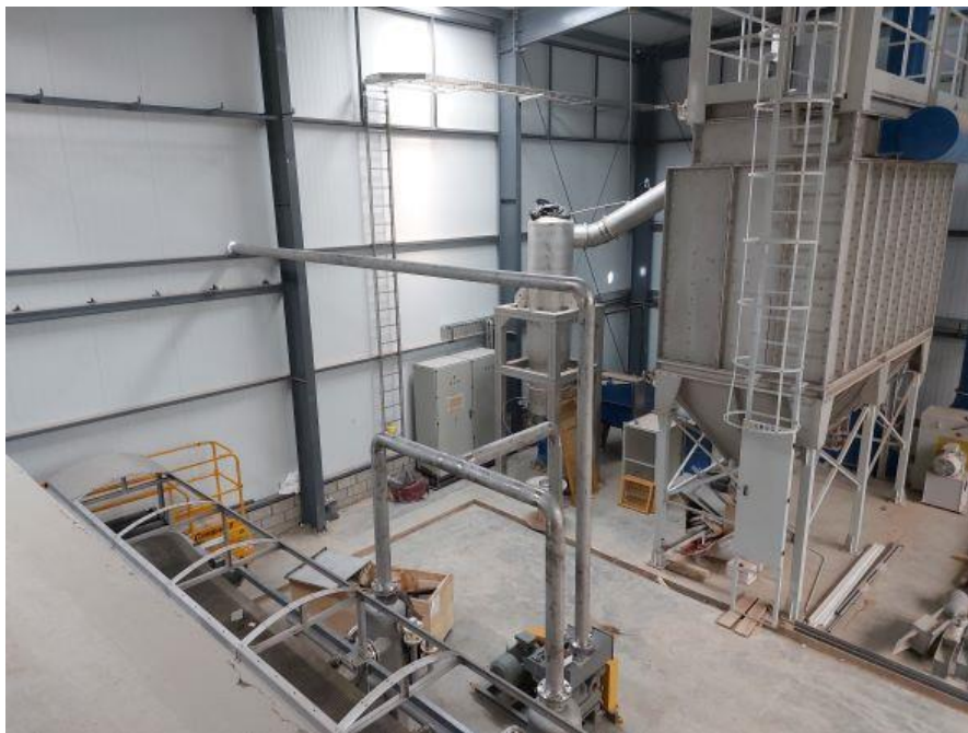
Figure 2. Rincon Lithium Project – 2,000tpa Operation Site Works in Progress

Construction works have comprised plant and equipment deliveries to site, assembly and installation of equipment and auxiliary systems, first phase commissioning works, completing the on-site office and laboratory, camp accommodation expansion and continued recruitment of operational staff.