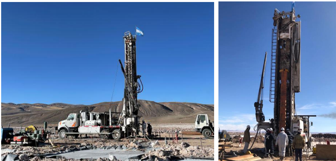
Figures 5-6. Rincon Lithium Project – 2,000tpa Operation Site Works in Progress

1 An Exploration Target is not a Mineral Resource. The potential quantity and grade of an Exploration Target is conceptual in nature. A Mineral Resource has been identified above the Exploration Target, but there has been insufficient exploration to estimate any extension to the Mineral Resource and it is uncertain if further exploration will result in the estimation of an additional Mineral Resource.