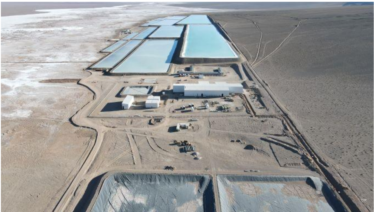
Figure 1. Rincon Lithium Project – 2,000tpa Operation Site Works in Progress

The construction phase comprises the process plant, equipment and associated installations, earthworks and site facilities (including additional camp development and associated site infrastructure), and expansion of the brine system (pumping station, plant settling ponds), with;