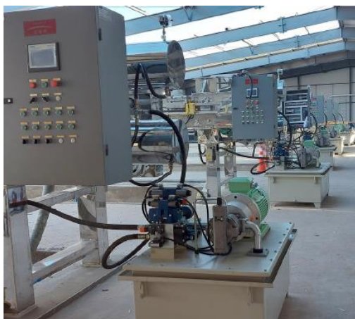
Figures 3-4. Rincon Lithium Project – 2,000tpa Operation Site Works in Progress