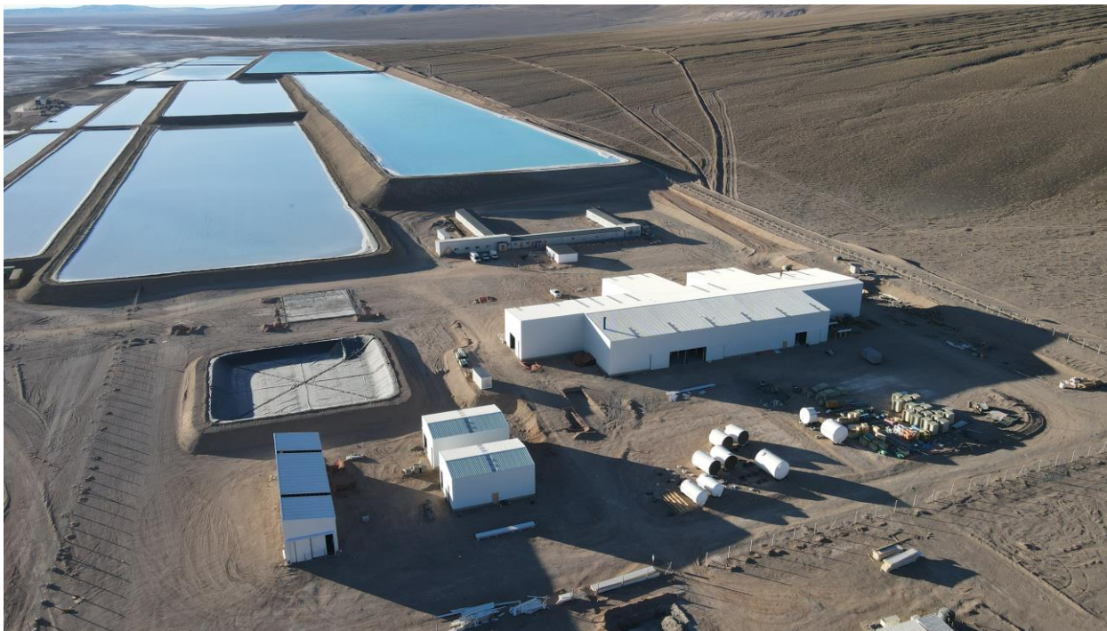
Figure 1. Rincon Lithium Project – 2,000tpa Operation