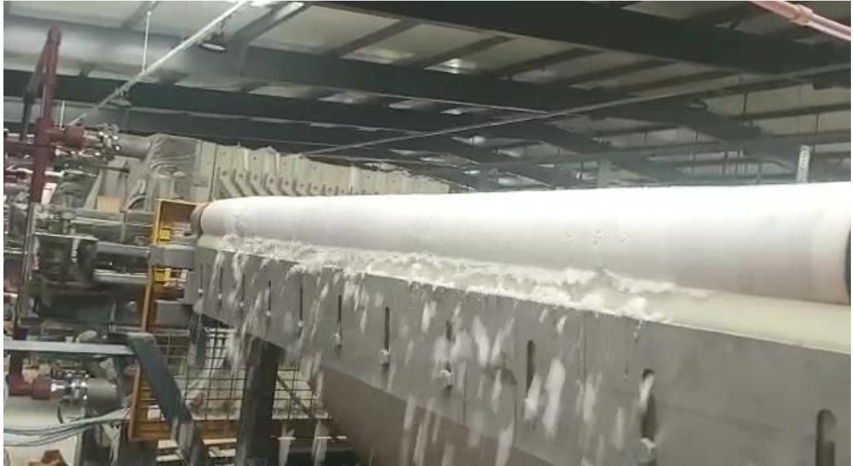
Figure 2. Rincon Lithium Project – 2,000tpa Operation Commissioning Works