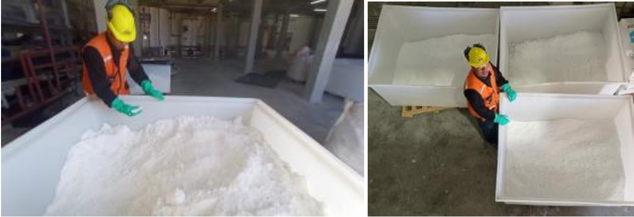
Figures 1-2. Rincon Lithium Project – 2,000tpa Operation Commissioning Works

Argosy is well positioned to take advantage of current and near-term lithium prices via the 2,000tpa production operations, with the Benchmark Mineral Intelligence lithium carbonate CIF Asia (spot) price recently quoted at US$72,000/t.