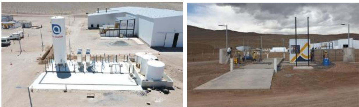
Figures 4-5. Rincon Lithium Project – 2,000tpa Operation Works