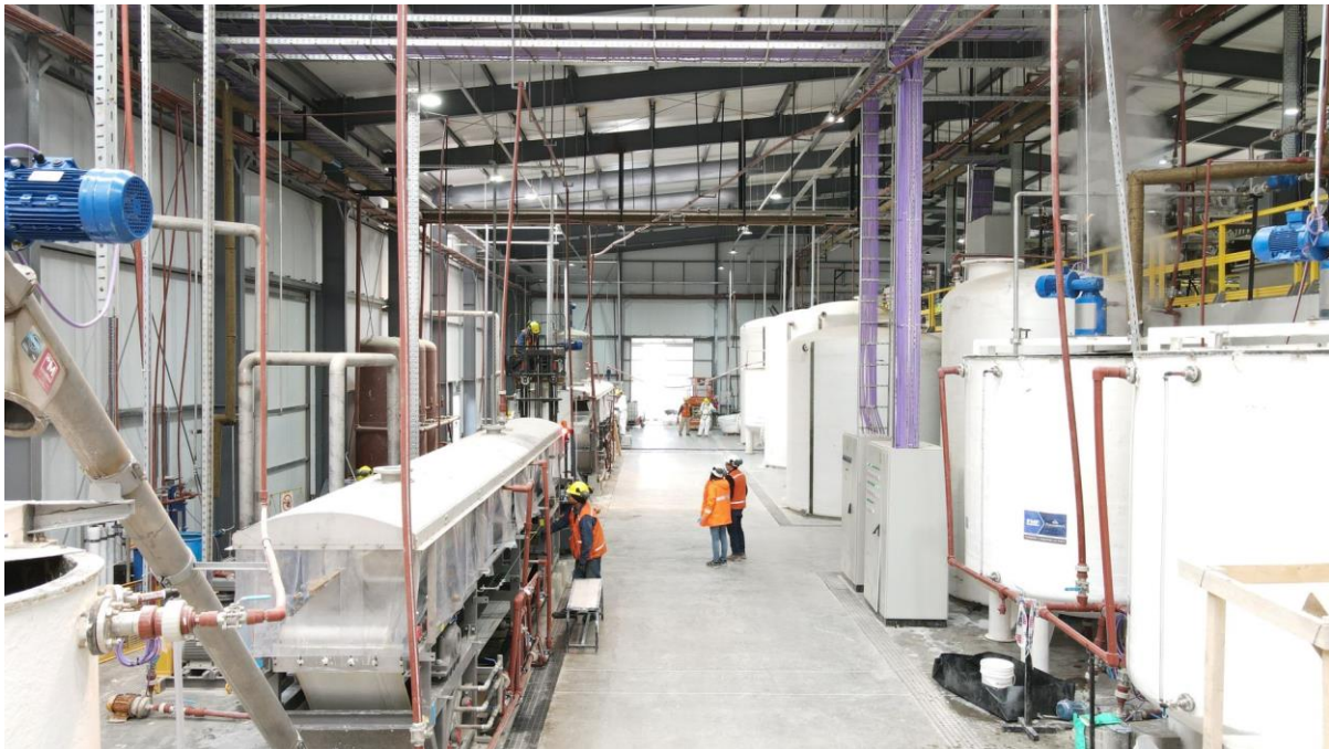
Figure 6. Rincon Lithium Project – 2,000tpa Operation Commissioning Works