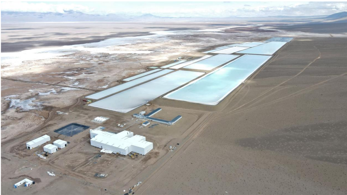
Figure 7. Rincon Lithium Project – 2,000tpa Operations Site