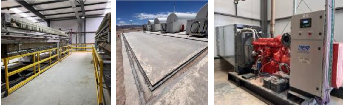
Figures 4-6. Rincon Lithium Project – 2,000tpa Operation Commissioning Works