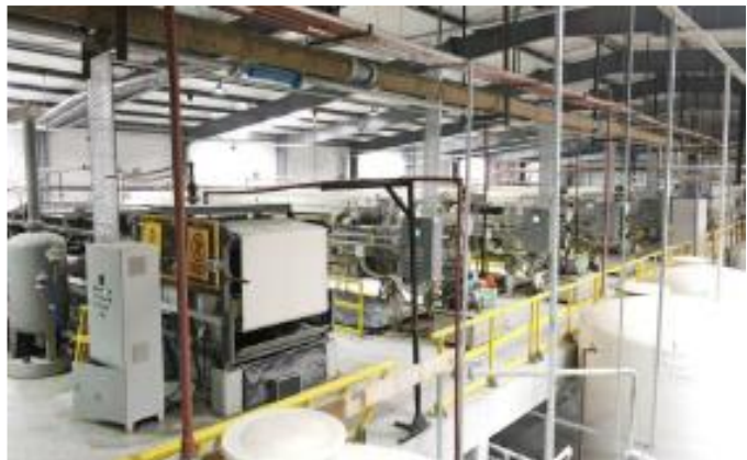
Figures 1-2. Rincon Lithium Project – 2,000tpa Operation Commissioning Works