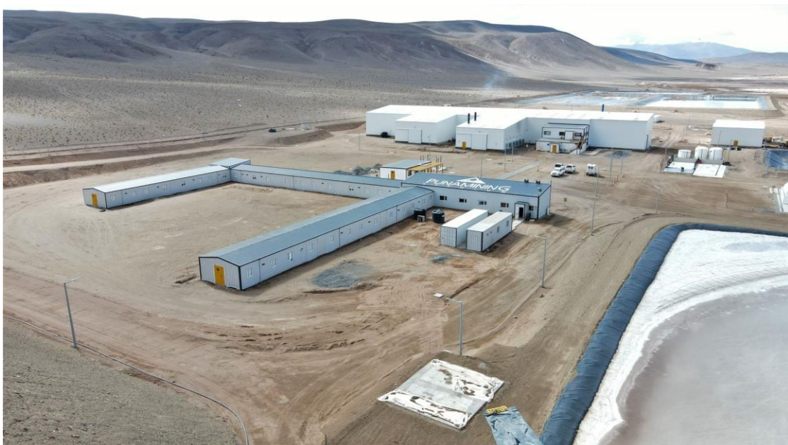
Figure 8. Rincon Lithium Project – 2,000tpa Operations Site