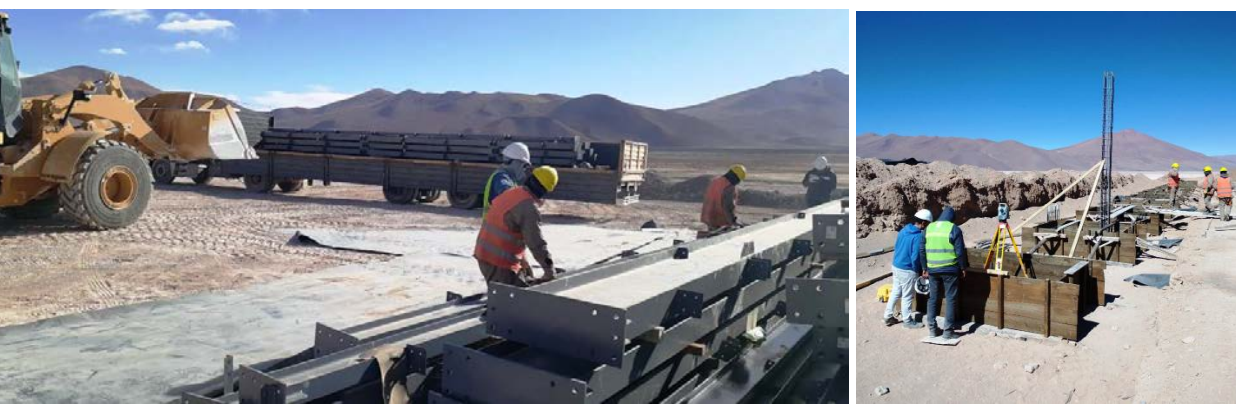
Figures 4-5. Rincon Lithium Project - 2,000tpa Operation Site Works in Progress

Plant and equipment requisition and procurement works are proceeding well on schedule, and early-lead items such as 500kVA electric power generators, 150kVA generators and piping for brine pumping operations, and site tanks have been secured. Longer-lead items such as boilers, cooler/chiller, process tanks and reactors are all being engineered and fabricated locally in Argentina, and are well in progress for delivery as scheduled. Other items, such as the evaporator/dryer are being manufactured in Germany, the filters are being sourced from Asia, whilst the mill was built in the USA and already delivered.