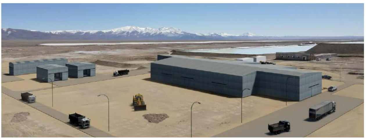
Figure 1. Rincon Lithium Project - 2,000tpa Operation Site Layout (schematic)

The 2,000tpa production operation major works are 40% complete, with three main phases of works - comprising design, construction and commissioning. The design phase (and engineering layout) is effectively completed (99%), the construction phase is at 36% completion, whilst plant commissioning works (comprising raw materials acquisition and tender works) are 7% complete.