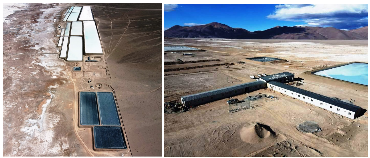
Figures 2-3. Rincon Lithium Project - 2,000tpa Operation Site Works in Progress

Plant and equipment requisition and procurement works are proceeding well on schedule, and early-lead items such as 500kVA electric power generators, 150kVA generators and piping for brine pumping operations, and site tanks have been secured. Longer-lead items such as boilers, cooler/chiller, process tanks and reactors are all being engineered and fabricated locally in Argentina, and are well in progress for delivery as scheduled. Other items, such as the evaporator/dryer are being manufactured in Germany, the filters are being sourced from Asia, whilst the mill was built in the USA and already delivered.